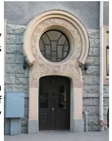
Detail with typical National Romantic decoration on a house built in 1908 by Konstantins Peksens

Branch Meetings are held at 7 Braidwood Road, Tarago on the 2nd Wednesday of the month, 10am for a 10.30am start