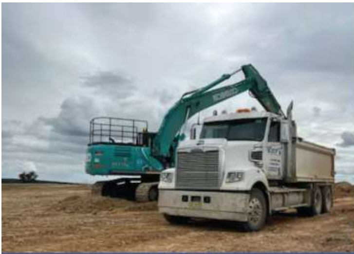
BIG AND SMALL JOBS