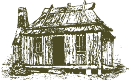
School House 1880

Windellama Progress Association Hall Inc.